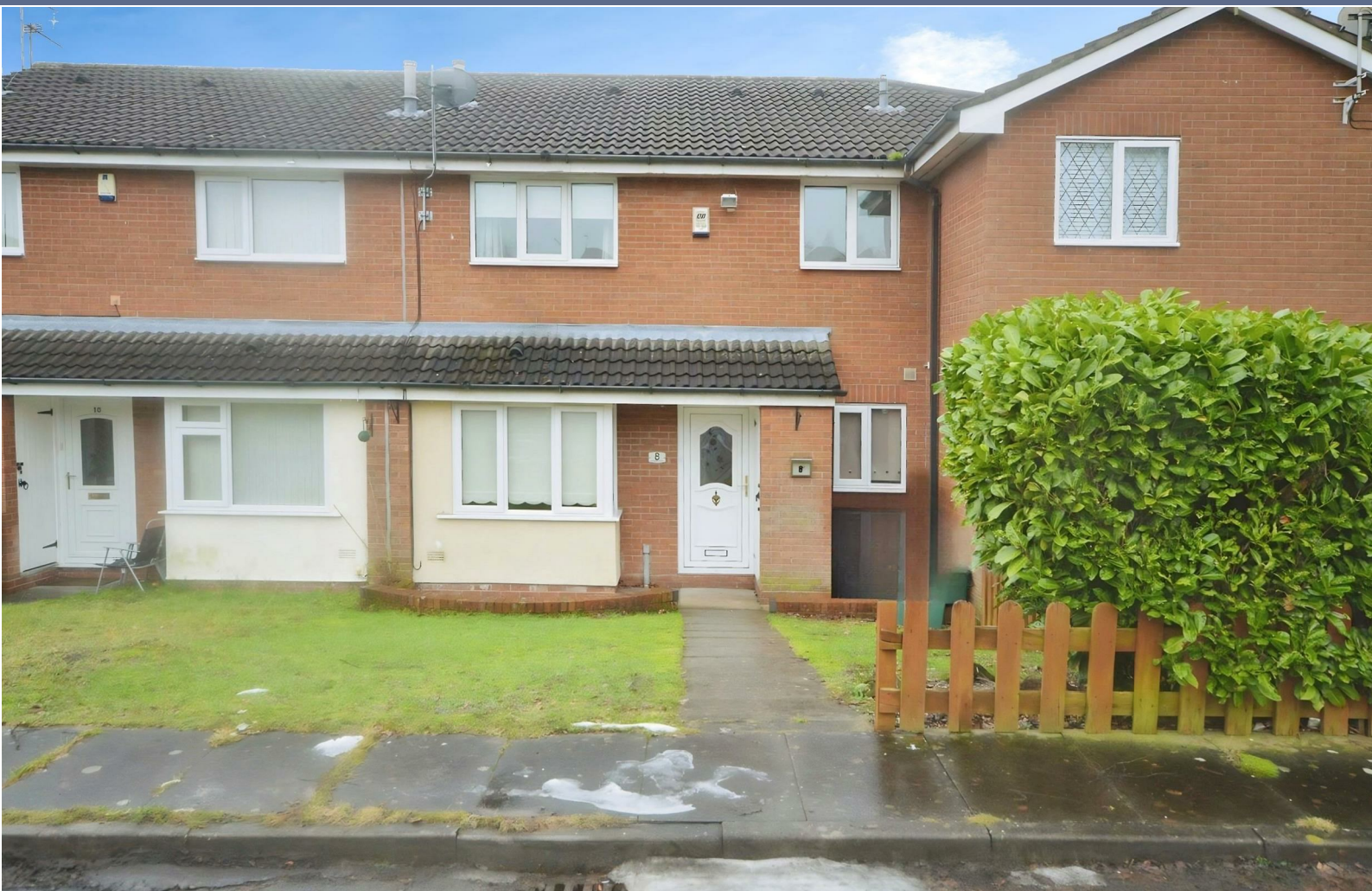
Haslington Close Waterhayes